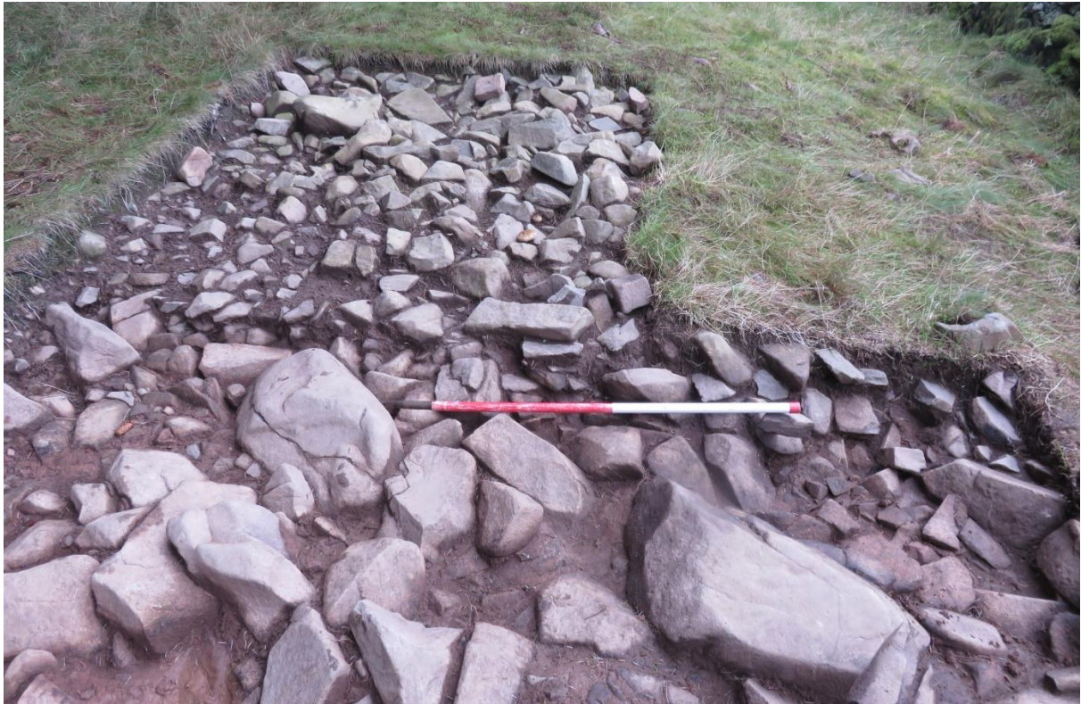
Figure 3 Section through cobbles C4 revealing underlying stony subsoil C7 in the foreground.