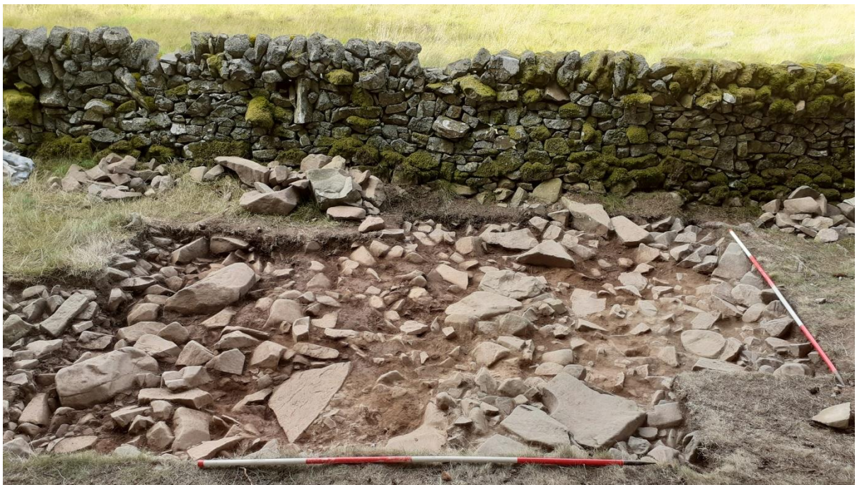
Figure 3 Trench 6 after excavation of cobbles showing subsoil C7, wall C8 top right corner, boulder wall C6 at right-angles.