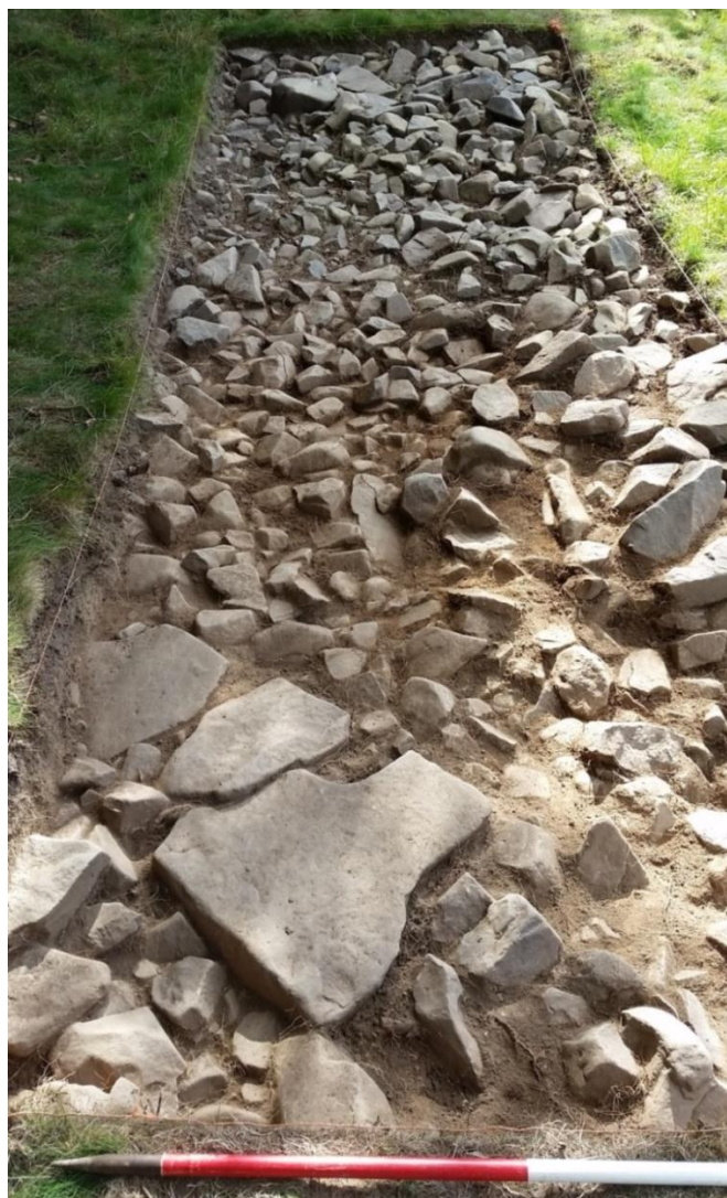
Photograph of Trench 7 from the N in 2019 showing the paved path and cobbles