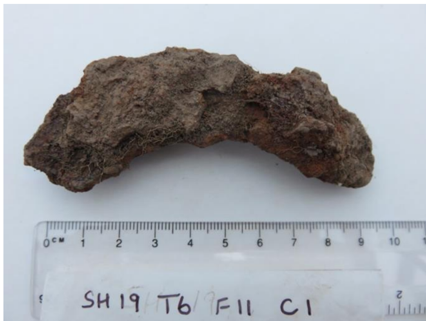
Figure 4 Possible horseshoe, F11

The clay pipe found under the revetment puts the cobbled and paved yard no earlier than the mid-17th century and coeval with phase 2 of peel house. Sherds of Late-medieval Red Ware were also found under the cobbles. The two earlier walls cannot be closely dated. The NE-SW wall may be the final iteration of the stony bank enclosing a late medieval yard on the other side of the drystone dyke that was partly excavated in Trench 7.